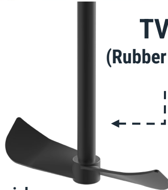
TVM (Rubber Lining)