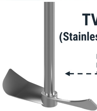
TVM (Stainless Steel)